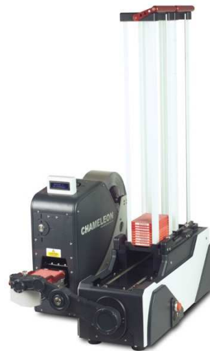
Plate re stack option allows the user if feeding and retrieving plates from a secondary piece of equipment and the need for defined plate stack orientation, the plates can internally be reprocessed into their original line format.

Scorpion comes in 4 standard formats, these are standard left or right feed, offering side placement from plate centre to plate centre of a maximum arc to 280mm or the extended version (XT) left or right feed, offering side placement from plate centre to plate centre of a maximum arc to 342mm